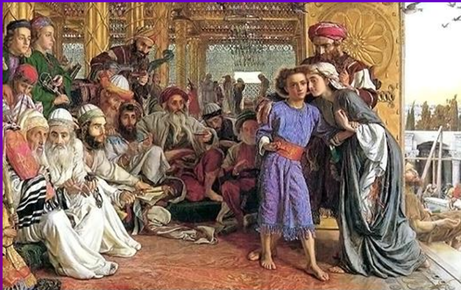
The Finding of the Saviour in the Temple by William Holman Hunt